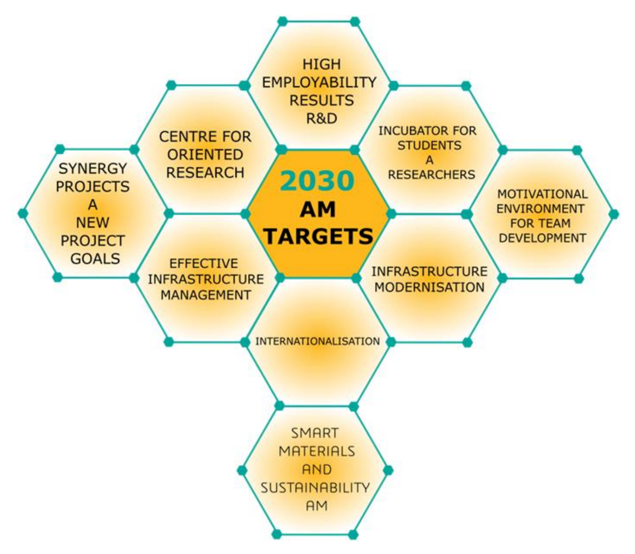
Fig. 1 - Structure of strategic objectives and priorities of the long-term cross-sectoral cooperation on the Innovative and additive manufacturing technologies platform- new technological solutions for 3D printing of metals and composite materials

These strategic objectives have a clear meaning and can be achieved through well-defined subactivities. The strategic objectives are set according to the current situation and based on the set cooperation across the platform - between universities and partners of the unique platform. The objectives are achievable and the implementation team is aware of the risks involved in achieving the objectives.